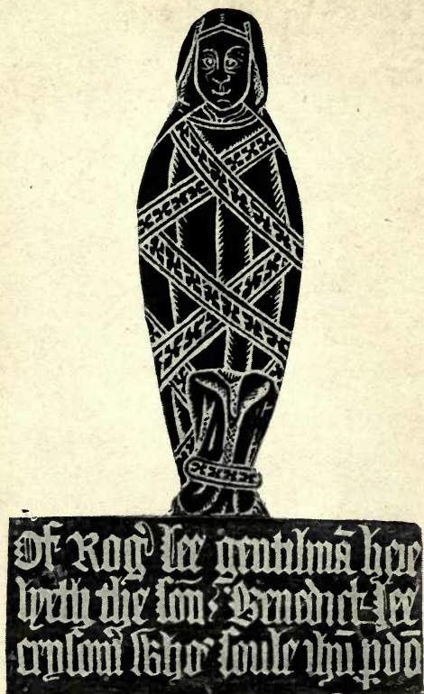
BRASS OF "CHRY SOM CHILD," A.D. 1520, CHESHAM BOIS CHURCH, CO. BUCKS.